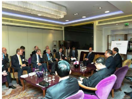
Distinguished guests from Myanmar and the United Kingdom